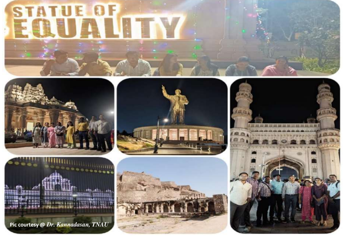
Exploring Hyderabad, The City of Pearls