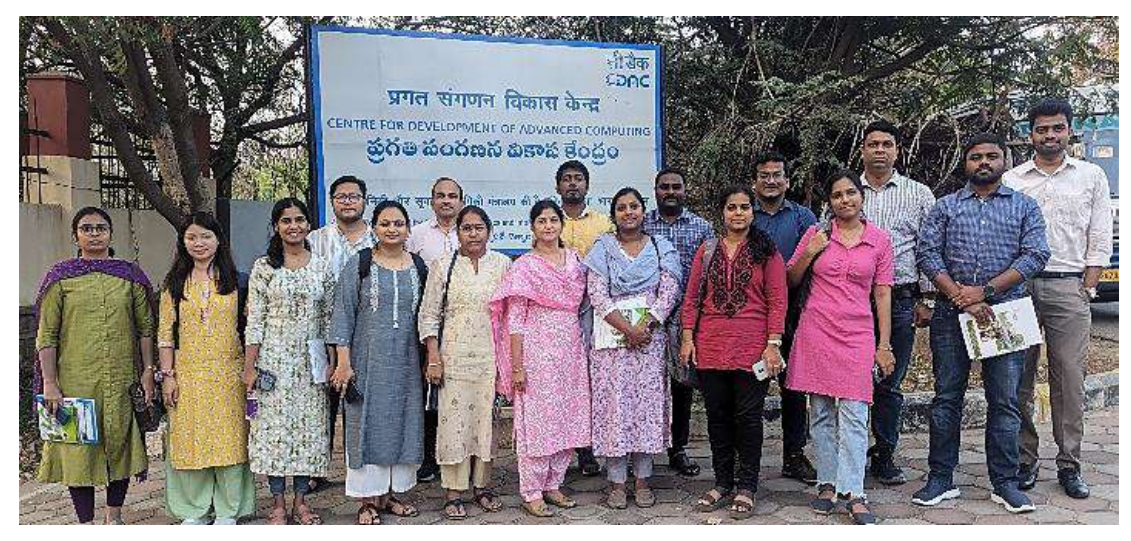
Exposure visit to C-DAC on 29 February 2024