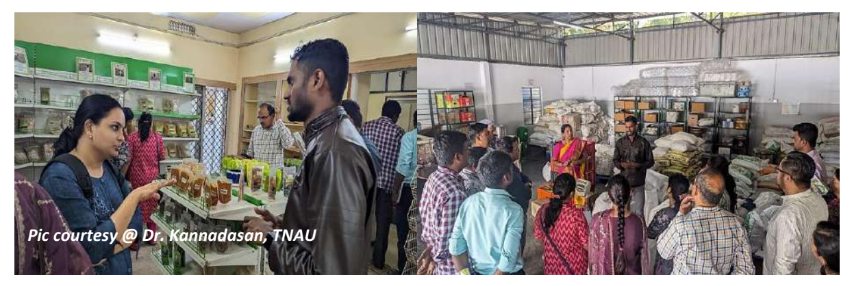
Exposure visit to Shahaja Aaharam Producer Company Ltd outlet and warehouse, on 27 February 2024

Sahaja Aharam is a federation of farmer producer organisations in Andhra Pradesh, Telangana and Maharashtra. Here farmers follow organic/natural farming practices. All the farmers are certified under NPOP organic certification or Participatory Guarantee System by the National Centre for Organic Farming. Our exposure visits to the collection centre and sales outlet of Sahaja Aaharam provided glimpses of activities and processes in the collection, packaging and marketing of organic products from FPOs supported under the Centre for Sustainable Agriculture.