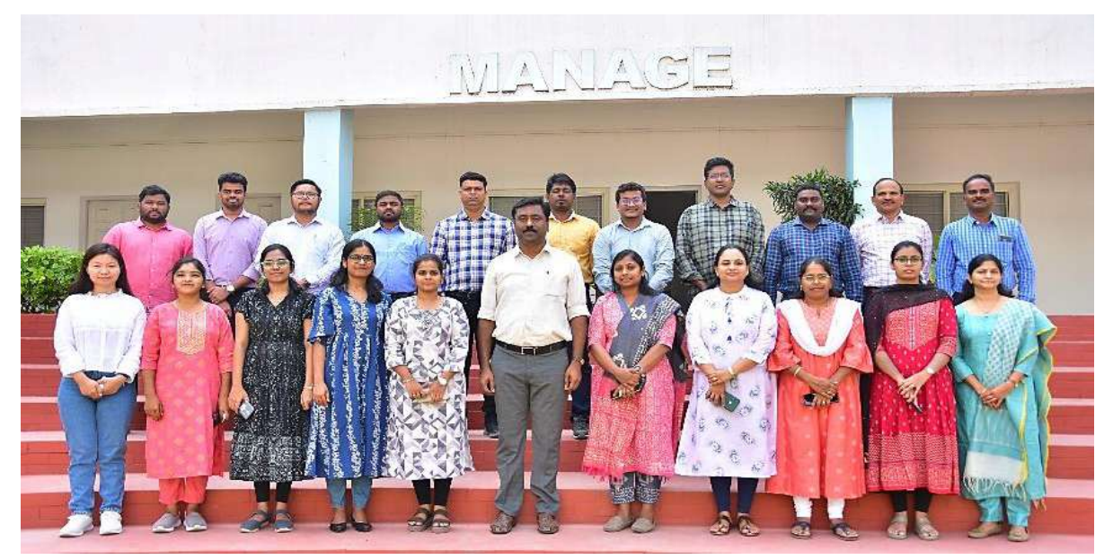
Participants during the opening session, MANAGE, Hyderabad, 26 February 2024.

Agricultural Extension has undergone massive changes in recent years. New theoretical perspectives and practical approaches are complementing its rapid growth. The revised post-graduate and PhD syllabus of ICAR's agricultural extension education has redefined the role of this discipline beyond the transfer of technology. The syllabus highlights the importance of Extension and Advisory Services (EAS) in enabling innovation by playing a bridging role between the various actors within the Agricultural Innovation System (AIS). There is a need to develop the capacities of faculty, researchers, extensionists and extension scholars to adapt to these transitions. Recognizing the need, the National Institute of Agricultural Extension Management (MANAGE), Hyderabad, under the University Alliance Programme, organized the National Faculty Development Programme on 'New Frontiers in Agricultural Extension' from 26 February to 1 March 2024. The programme's aim was to familiarise participants with the emerging areas in extension research, practice and policy and to explore how these new and emerging areas are integrated into extension teaching and training. The five-day programme had 17 participants from the ICAR research institutes, Krishi Vigyan Kendras (KVKs), Central University, State Agricultural Universities (SAUs), Private Universities as well as research scholars.